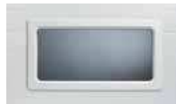
24" X 12" INSULATED GLASS Available with either a black or white frame.