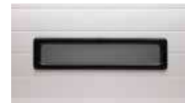
24" X 6" DOUBLE INSULATED ACRYLIC WINDOWS WITH BLACK FRAME